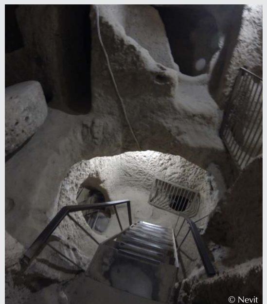
Photos from top: Cappadocia, hot-air balloon ride in Cappadocia, Whirling Dervishes, looking down into the Kaymakli Underground City tunnels