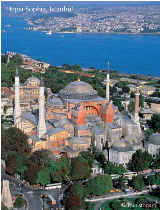
Hagia Sophia, Istanbul

Eos Study Tours, PO Box 938, 47 Main Street, Suite One, Walpole, NH 03608