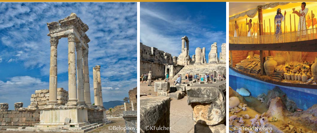
Photos (from left): Pergamum, Didyma, Bodrum Museum of Underwater Archaeology